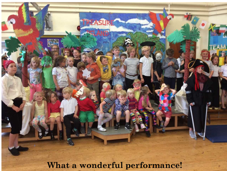
What a wonderful performance!