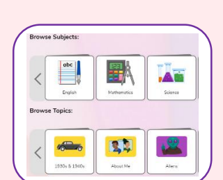
Subjects & Topics