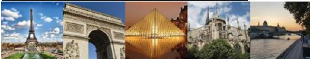
la tour Eiffel