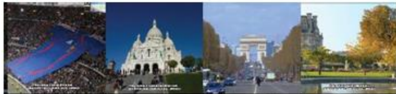
le Stade de France